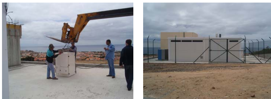
Fig 4: Fuel Cell installation and front view of the site.

Site construction began in May 2008 with the concrete platform and a safety wall being built. In June 2008 were installed both FC and the hydrogen storage tank. During July all the other equipments were installed and the operation testing began in September.