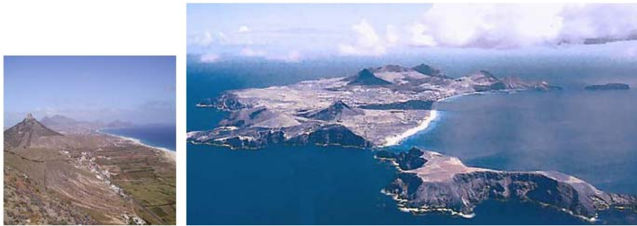
Fig 1: Porto Santo Island

Porto Santo (see Fig. 1) is inhabited by 5000 year long residents, most of them living in the capital, Vila Baleira, but the number increases significantly during summer months. The number of tourists and part time second house residents fluctuates between 500 in the wintertime and reaches up to 15,000 in the summertime. Tourism has given Porto Santo an economic dynamism that has been growing year by year. The construction of its airport in 1960, further expanded in 1973, was an important factor that contributed decisively to the island's economic and tourist expansion (Duic'and Carvalho, 2004).